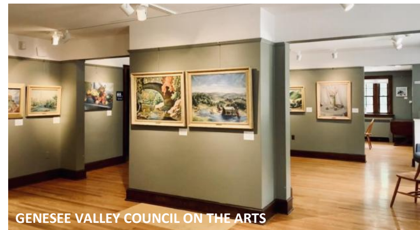
GENESEE VALLEY COUNCIL ON THE ARTS

THIS INFORMATION HAS BEEN SECURED FROM SOURCES WE BELIEVE TO BE RELIABLE, BUT WE MAKE NO REPRESENTATIONS OR WARRANTIES, EXPRESSED OR IMPLIED, AS TO THE ACCURACY OF THE INFORMATION. REFERENCES TO SQUARE FOOTAGE OR AGE ARE APPROXIMATE. UPLAND HAS NOT REVIEWED OR VERIFIED THIS INFORMATION. BUYER MUST VERIFY THE INFORMATION AND BEARS ALL RISK FOR ANY INACCURACIES.