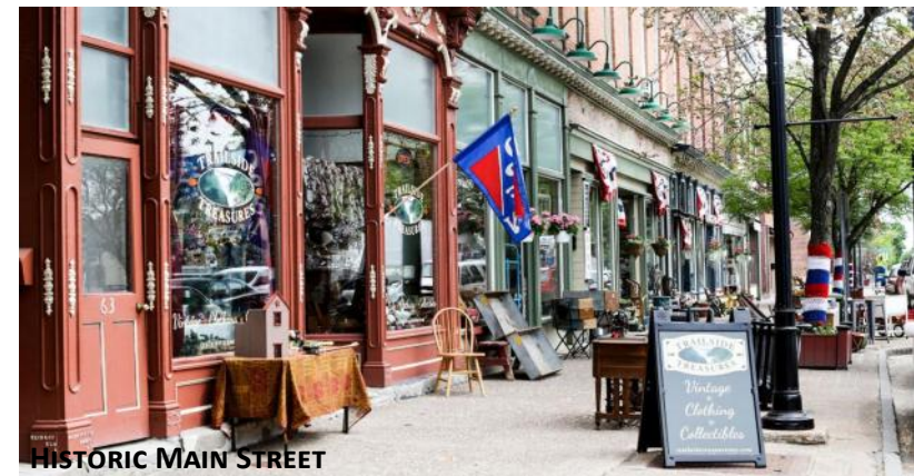
HISTORIC MAIN STREET