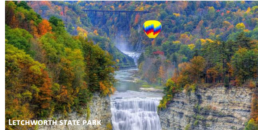
LETCWORTH STATE PARK

Visitors often spend their afternoons browsing the village’s curated collection of antique shops, such as Allegiance Antiques, or visiting Wendy’s Pantry for old-fashioned sweets and local delicacies. The local dining scene ranges from the patriotic atmosphere of Brian's USA Diner, a staple for hearty breakfasts, to the relaxed environment of the High Banks Tavern.